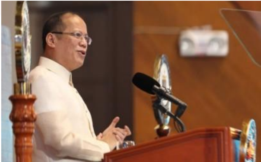
Pres. Benigno S Aquino, III State of the Nation Address (SONA) July 22, 2013

"Napakasarap maging Pilipino sa panahong ito."